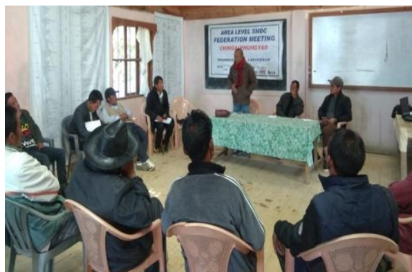
Chingai Area Level SMDC meeting Ngahui village

Five Area Level Meetings (three for Chingai cluster and two for Phungyar cluster) with the SMDC members (70 members) were held in which the members shared the status and progress report of their respective schools and discussed the grievances like the functioning of the schools, shortage of teachers and transfer of teachers on utilisation, status of the students, upcoming programs etc. and also shared how to tackle the grievances together. Federation members were also informed and made aware of the shifting of the project to remote border villages in the next phase.