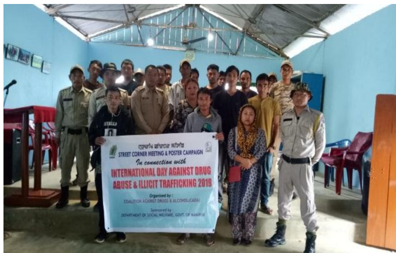
INTERNATIONAL DAY AGAINST DRUG ABUSE & ILLICIT TRAFFICKING WITH POLICE OF KASOM 2019