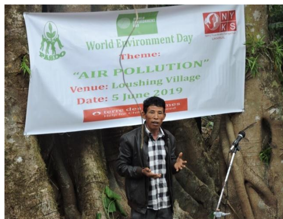
World Environment Day, 5th June, 2019 celebrated at Loushing Village