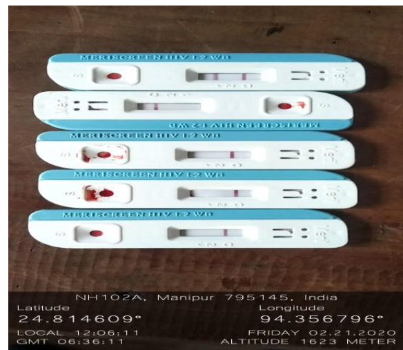
COMMUNITY BASED SCREENING CAMP AT PHUNGYAR ON 21/02/2020