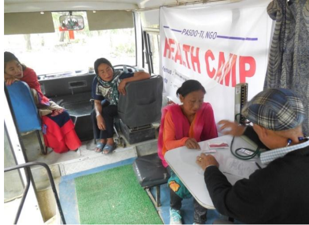
COMMUNITY HEALTH CAMP ON 12/11/2019 PASDO-TI, UKHRUL