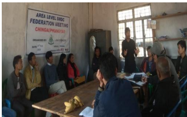
Phungyar Area level SMDC meeting at Chungka village