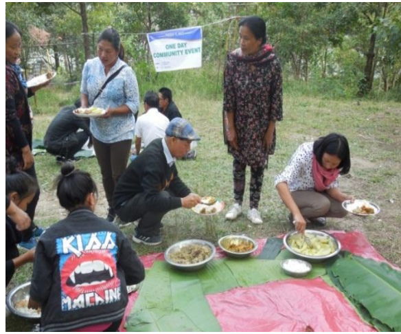
COMMUNITY EVENTS 8 th Nov.2019 Venue: ORCHID PARK, UKHRUL